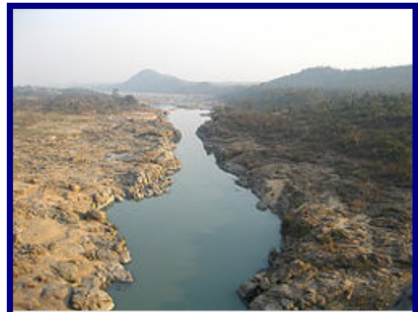
View of the upper Damodar river in Jharkhand state

The Lower Damodar Sub-basin area is historically flood prone. On average, about 33,500 hectares of cropped area and 460,000 people are affected every year. Although there are five large dams within the upper basin in Jharkhand state, initial thoughts are that these dams are not being managed as effectively as they could be and Frank is attempting to scope out how dam operation might be improved by the project, both to increase post-monsoon irrigation water availability and also to provide more effective flood mitigation.