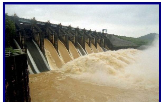
Outflow from the Maithon Dam on the major Barakar River tributary, during peak monsoon in August 2015