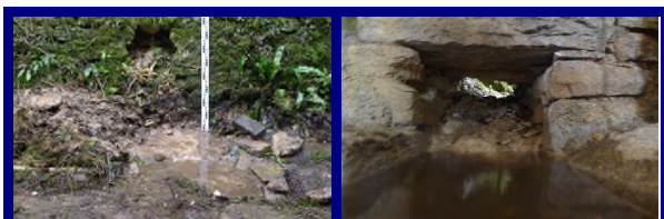
Groundwater springs at the base of a wall